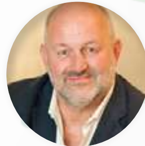
WERNER VOGELS CTO AMAZON.COM