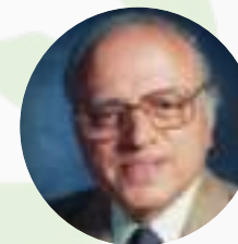
Member M.S. SWAMINATHAN Founder and Chairman MS Swaminathan Research Foundation