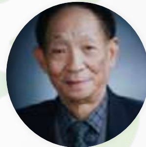
YUAN LONGPING Father of Hybrid Rice China National Hybrid Rice Research and Development Center