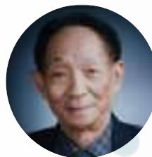
Member YUAN LONGPING Director General China National Hybrid Rice Research and Development Center